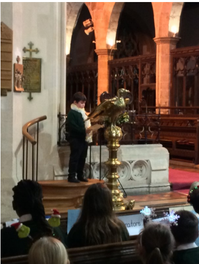
Christmas Carol Concert at St Oswald's Church